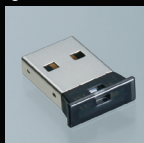
USB Bluetooth® adapter included