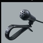
Wired MIC included